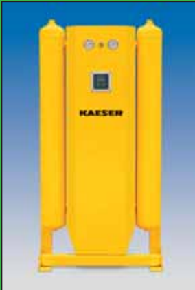
Heatless Desiccant Dryer