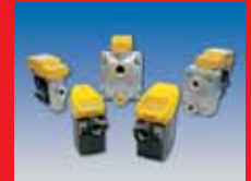
Eco-Drain Series Drain Traps