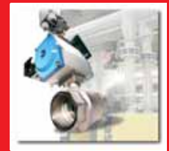
Air Main Charging Valve