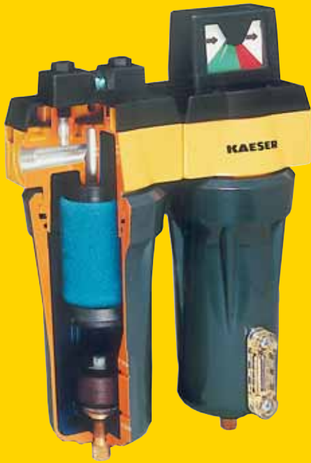
Extra-fine filter shown