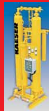
Breathing Air System