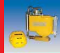
Automatic Magnetic Drain Traps

W ith more and more companies operating under ISO certification, many plant engineers need a method of ensuring process air quality. Air Quality Monitors use capacitance hygrometers and photometers to accurately and reliably analyze compressed air contamination, pressure dew point and temperature at a given point in the system. The real-time monitoring and variable alarm set points provide broad sensing capabilities. Most units can be easily customized for different systems or applications.