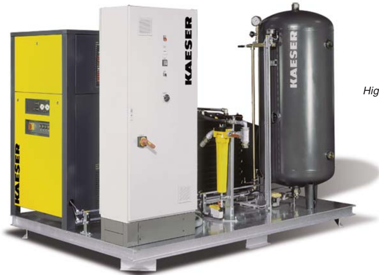
High pressure system for PET bottle making

Kaeser's skid-mounted offerings provide a complete compressed air system that's easy to transport without sacrificing on features or performance. They are the go-to choice for demanding manufacturing, petro-chemical, and other industrial applications.