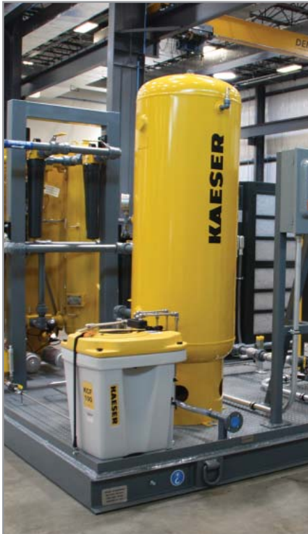
Air receiver tanks and condensate management