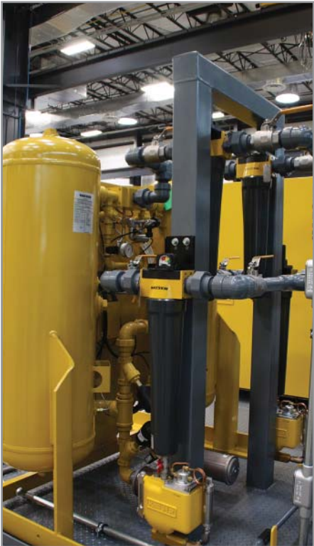
Full range of compressed air filtration