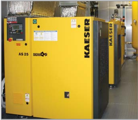
Rotary screw compressors