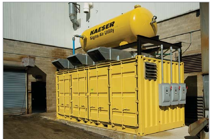
Plant air system for engine parts manufacturer