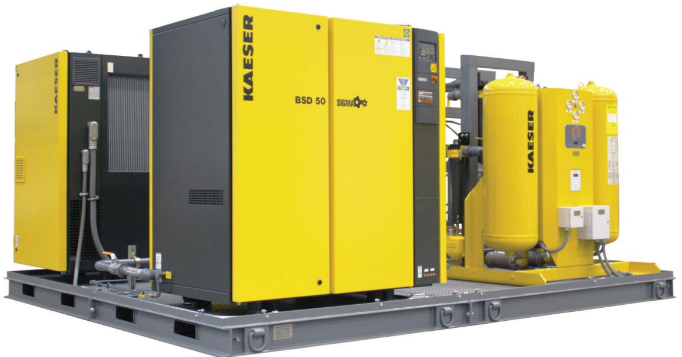
Instrument air for natural gas pumping station