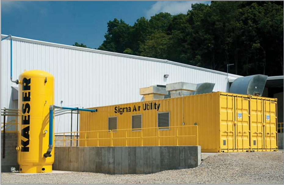
600 total hp for an automotive parts manufacturer

Do you produce your water, gas, and electricity? Probably not. So why own and operate compressors if you don't have to. Let Kaeser—The Air Systems Specialist—plan, install, and maintain a complete air system in your plant, so you can focus on running your business.