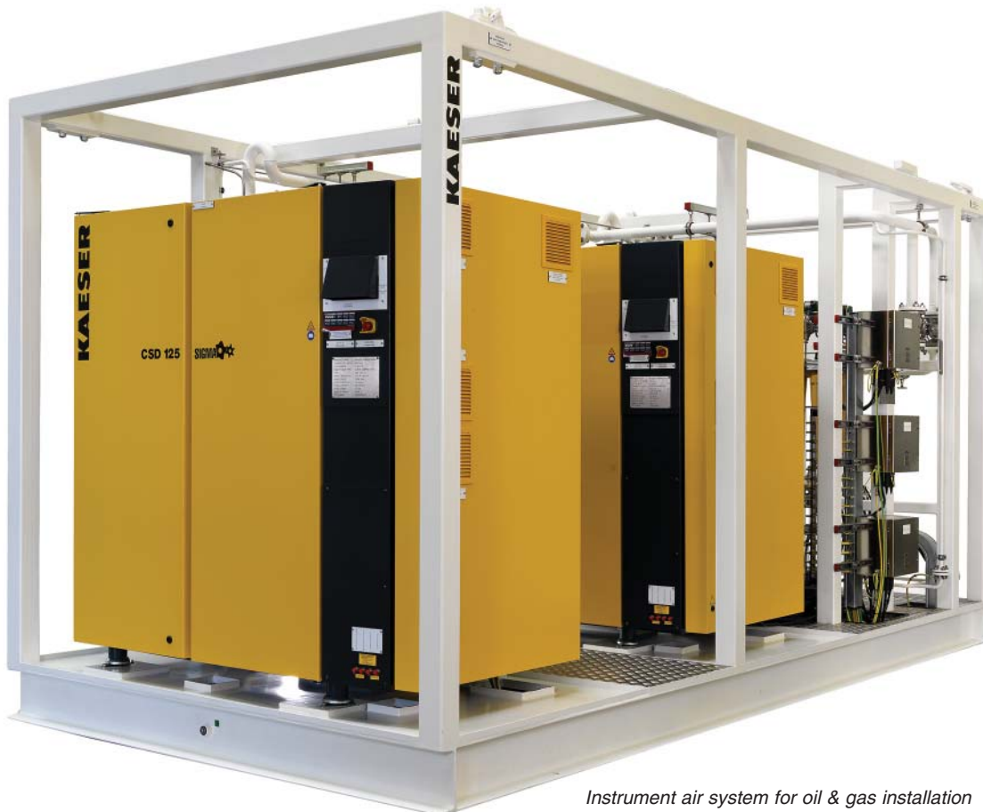
Instrument air system for oil & gas installation