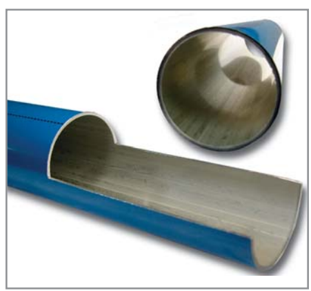
Cutaway of 5-year-old SmartPipe. Inside remains smooth and clean with no contaminant build up or pressure loss.