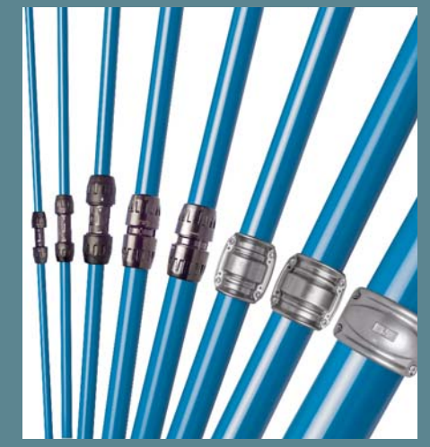
Rigid aluminum calibrated pipe ensures clean air and optimum flow rate performance.

The SmartPipe line includes all the accessories you need for a top quality installation: