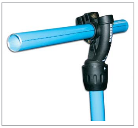
Integral condensate retention design for superior flow without pressure drops.

SmartPipe is ideal for installations requiring the highest quality air. Aluminum material will not rust or corrode. Further, it has no rough surfaces or interior restrictions that accumulate contaminants. The smooth interior with full bore design allows them to flow to your dryers and filters for efficient removal.